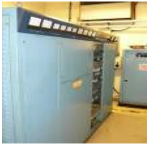
Derritron 36KVA Valve Amp.