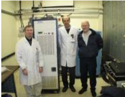
The new ETS 40KVA Switch Mode Amplifier One 19 inch rack with 4 power modules replaces the old valve amplifier